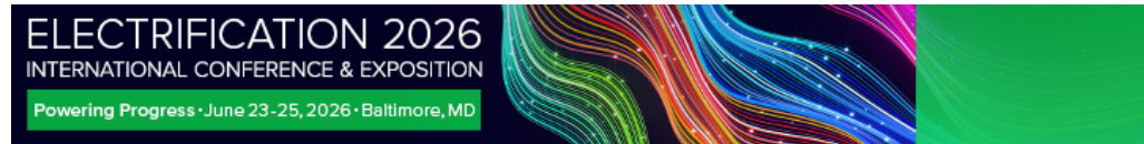
Leaderboard 728 × 90 px