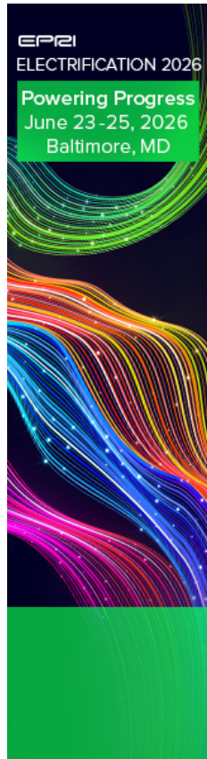
Wide Skyscraper 160 × 600 px