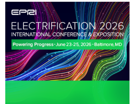
Medium Rectangle 300 × 250 px