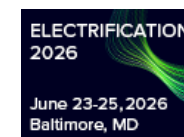
Button 1 120 × 90 px