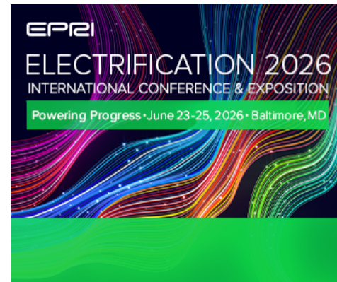
Large Rectangle 336 × 280 px