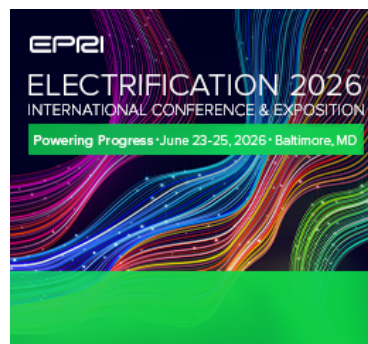
Special 1 260 × 240 px