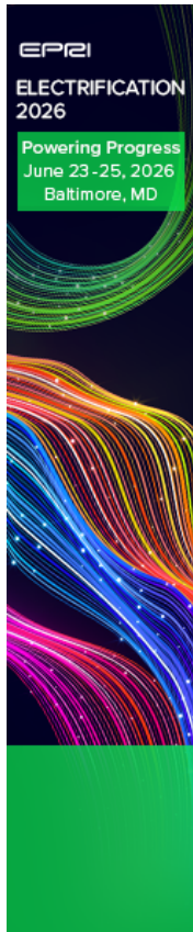
Skyscraper 120 × 600 px

Click on the image to launch it in a browser window. Then open the file in a PDF program and edit the footer copy appropriately. Any edits made to banners should be in Arial font. Export the banner as an image by going to File > Export To > Image > PNG .